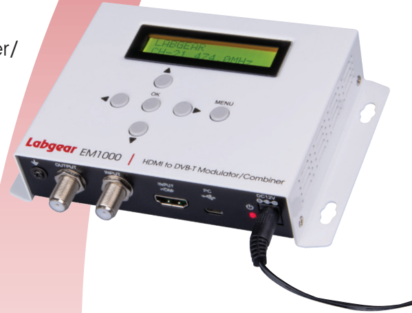
OmniLink+ Kit - Part No: 27872HS